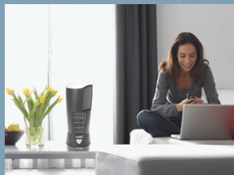
Pivoting Top Module for Precision Air Delivery Moves Air in Two Stationary Directions