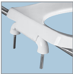
PLASTIC HINGES WITH STAINLESS STEEL POSTS AND PINTLES