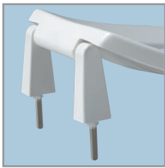
3" LIFT HINGES AND BUMPERS